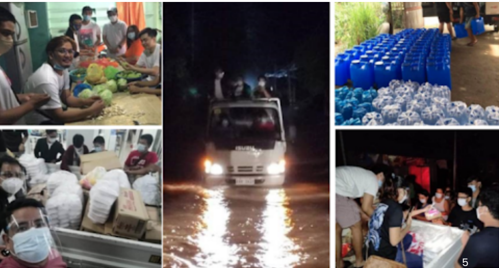
The community partner's relief efforts during Typhoon Ulysses