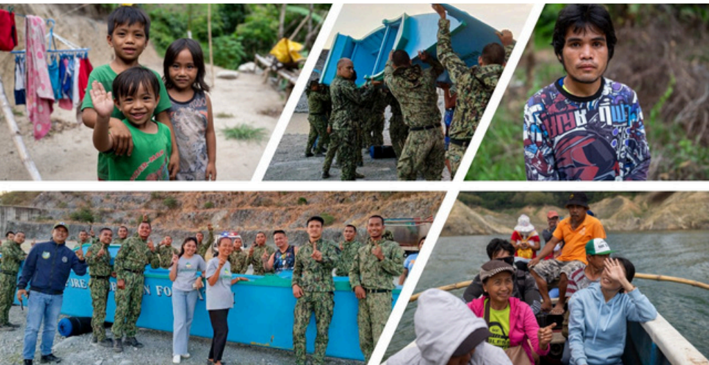
A pastor treks for hours to aid Sitio Guh-ban's mountain community, cut off and relying on fishing for livelihood. With their vital boat in disrepair, Pure Bayanihan donated a new boat to support their transport and livelihood.

Broader Impact: By working with a partner network, your nonprofit can contribute to a more comprehensive and coordinated approach to addressing complex social issues in foreign countries.